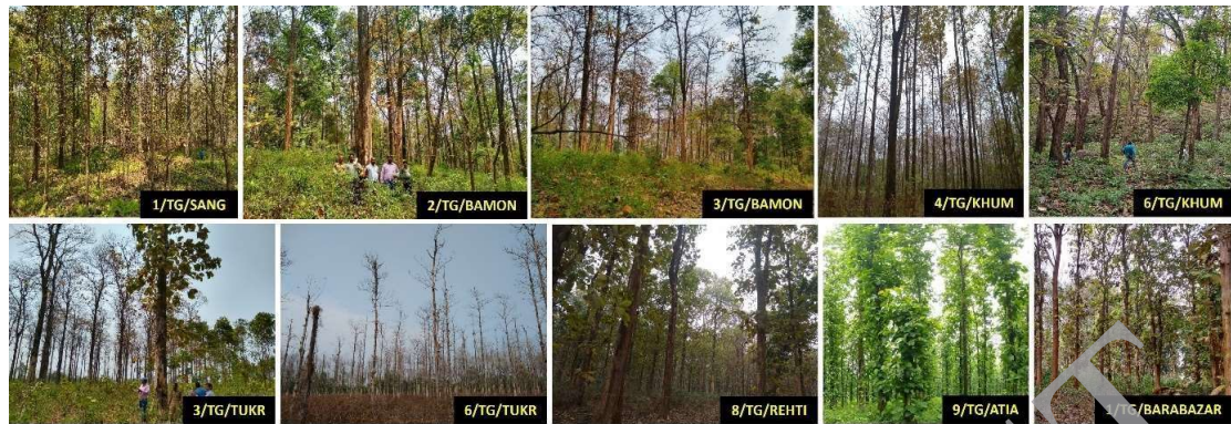
Figure 1: Evaluated teak seed stands for recommending SPAs