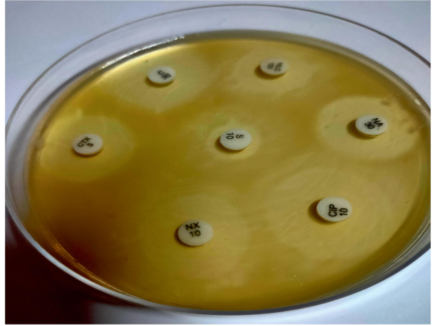
Figure 3: Sensitivity pattern of E. coli isolates against various tested antibiotics

tetracycline was observed by other scientists viz. 100% by Sarker et al. (2019) in E. coli from broilers. A high level of resistance to tetracycline (83.08%) and co-trimoxazole (76.92%) reported by Sharada et al. (2008) and resistance to co-trimoxazole (88%), ciprofloxacin (83%), norfloxacin (78%) and tetracycline (77%) noted by Kar et al. (2015) in E. coli isolates from poultry faecal and cattle milk samples is in contrast to