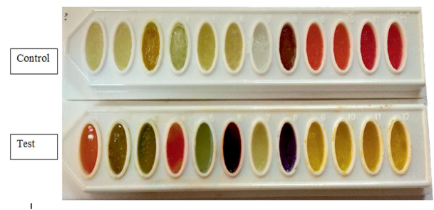
Figure 1: Metabolic and biochemical reactions by Hi E. coli TM Identification Kit.