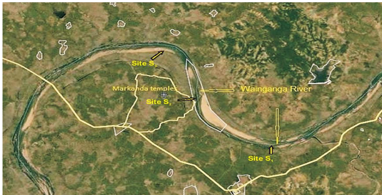
Fig 1. Satellite image of Wainganga River at Markandadeo Dist.- Gadchiroli (M.S.) showing three different sampling sites i.e S 1 , S 2 & S 3 (Courtesy : Google photo).

The fresh sample of phytoplankton was observed immediately under labomed compound microscope and identified with the help of standard available keys (Bellinger and Sigeo, 2010 and Reynolds, 1984) and then preserved in 4% formalin. The quantitative analysis of phytoplankton was carried out by using Sedgewick Rafter Cell (S.R. Cell) and the photographs were taken by Celestron 2 MP digital microscope imager. The collected data of phytoplankton of all groups were analyzed for calculating mean and standard deviation.