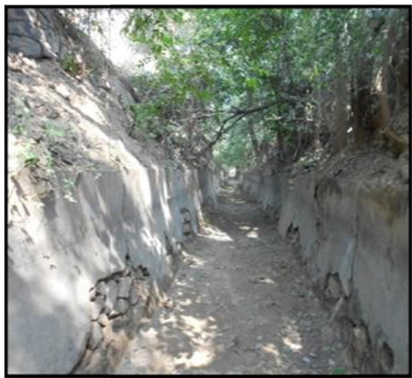
Figure 6: Damaged lining and trees are grown on sides of BBC at RD:517 chain