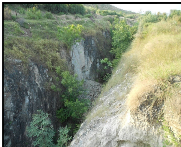
Figure 3: Blockage of canal water due to sliding of sides of valley in BBC at RD:187 chain