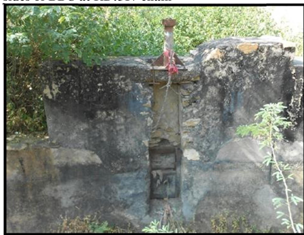
Figure 7: Damaged sluice gate at the head of Chudiyawara minor-I in BBC at RD:432 chain