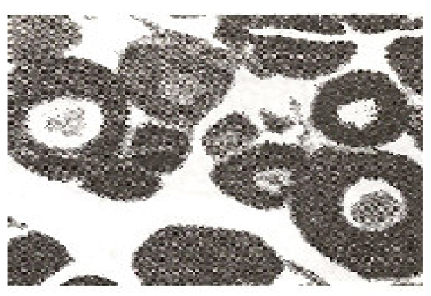
Fig.3: Photomicrograph of a part of longitudinal section of ovary of Hetropneustes fossilis X28 (Control) 38a. Mature oocytes

The ova are distantly distributed and enclosed in columns. That indicates the failure of ovarian differentiation. The Zebra fish, Branchyclonio rario, when held in water containing 5 ppm of zinc for a days period, the gametes were maturing showed delayed in spawning (Speranza, et al. 1977).