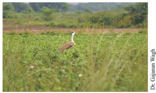
Fig. 3 a. GIB (Male) sighting at Wanoja