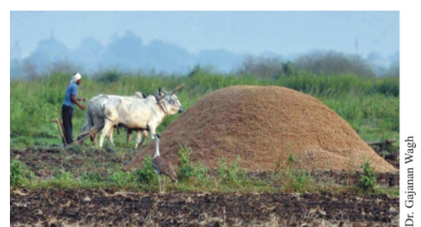
Fig. 3 b. GIB & farmer friendship association at Wanoja