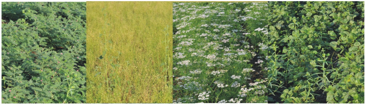
Jawas (Oriza sativa) Sambar (Coriandrum sativum) Soyabeen (Glycine max) Chana (Citer sp.) Fig. 2: Mixed cultivated crop pattern in the study area