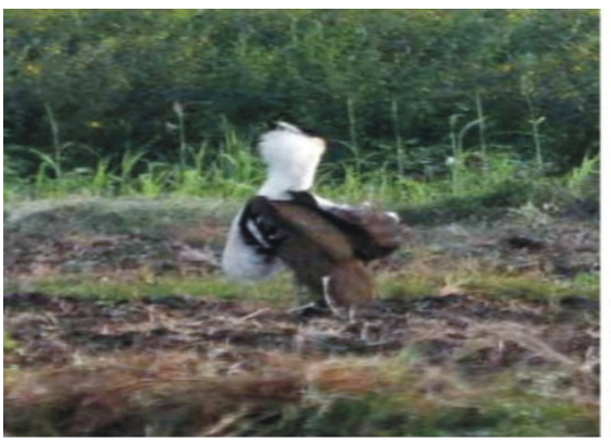
Fig. 3d. Male in displaying at Marda

information of breeding of the GIB from Wanoja and Marda from a local informer and the authors confirmed this information from the Warora range Forest department. After that immediately we carried out the survey of the nesting sites of GIB in Bhatali, Wanoja and Marda area. During the survey, we visited three nesting sites along with the local informer in Wanoja and Marda area, one nesting site in Bhatali area could not be visited on the same