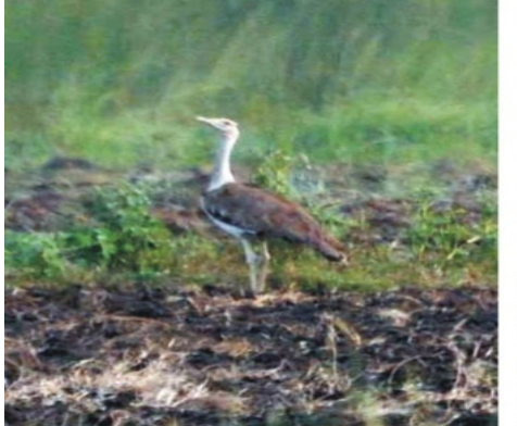
Fig. 3 c. GIB (Female) at Marda