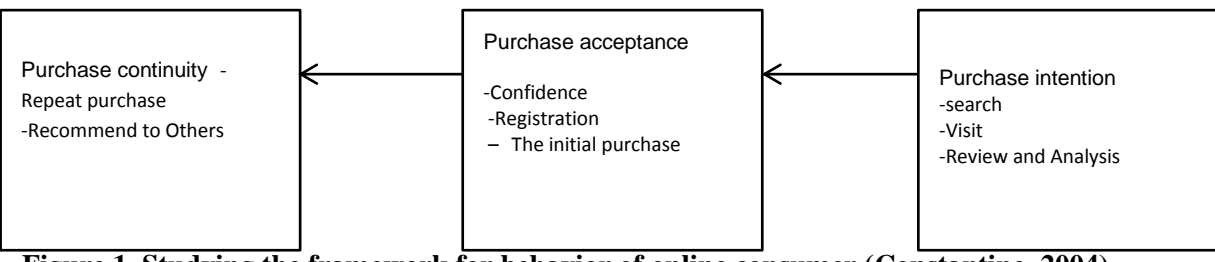
Figure 1. Studying the framework for behavior of online consumer (Constantine, 2004)

With regard to Constantine's classification at the area of internet purchase behavior, consumers' behavior has three components including purchase intention, purchase acceptance and purchase continuity.