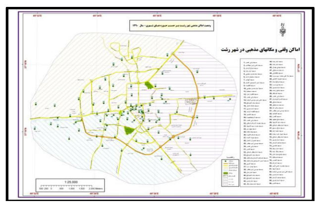
Fig-1Regarding above tables effect of endowed lands in spatial development of Rasht city in three recent years has had uprising process of moderate to low.