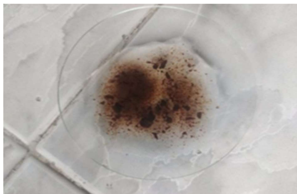
Figure 1: Silver nanoparticles synthesized from Wrightia tinctoria pod extracts

These findings suggest that the silver nanoparticles that formed antimicrobial activity against these two bacterial strains. AgNPs are known to have good inhibitory effects on gram-positive and gram-negative bacteria (Cavassin et al. , 2015). These antibacterial activities of the AgNPs can be attributed to the physicochemical properties of the