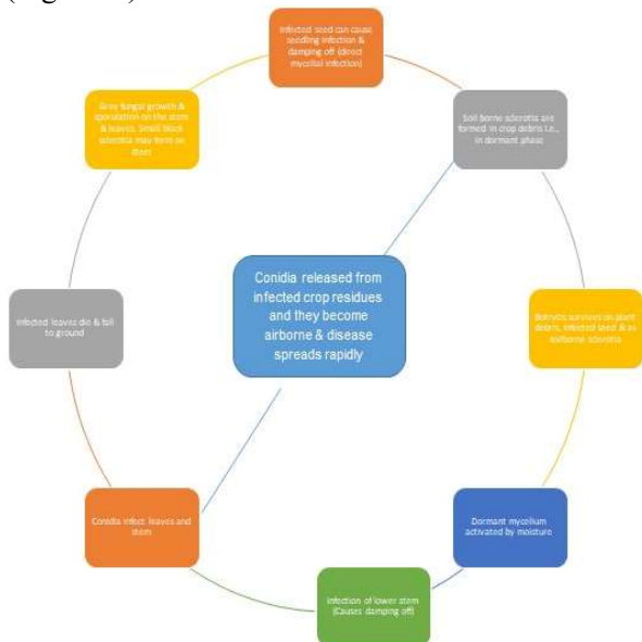
Figure 4: Disease cycle of Botrytis Grey Mould in chickpea

along the stem, infecting other stem (Knights and Siddique, 2002). The fungus survives on infected seed, as a saprophyte on decaying plant debris and as soil-borne sclerotia. The disease is often established in new areas by sowing infected seeds. Masses of spore can be produced on infected plants. These fungal spores can be carried from plant to plant by air currents and spread the disease rapidly (Figure 4).