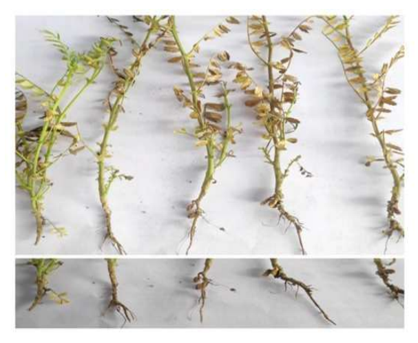
Figure 5: Root rot disease