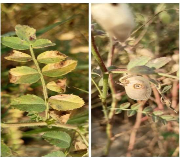
Figure 2: Ascochyta blight symptoms on chickpea. a) aerial part infection. b) infected pod

All of the plants aerial components are susceptible to developing Ascochyta blight symptoms. Brown lesions form at the stem base of newly emerging seedlings due to seed-borne illness. Following that the lesions expand in bulk and encircle the stem, breaking it and plants demise. Many pycnidia appear on the necrotic wound. These plants tend to cluster in patches but they can spread quickly 2). Depending on threat, plants are (Figure attacked at any stage of growth. Younger leaves are infected by Conidia and Ascospore, which produces tiny, necrotic areas drenched in water that quickly become larger and coalesce. When symptoms spread quickly to all aerial components, such as leaves, petioles, flowers, pods, branches and stem, tissues quickly collapse and the affected organism dies. Infected pod frequently causes seed infection and infection during the pod maturation stage often result inshriveled and infected seed (Foresto et al., 2023).