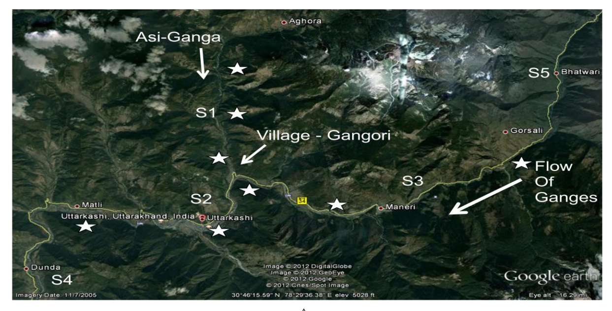
Fig. 2 Location of study area in district Uttarkashi. A Represents spread of brown trout in the area. S1 to S5 are the survey sites. Majority of work on feeding behavior is from site S1.