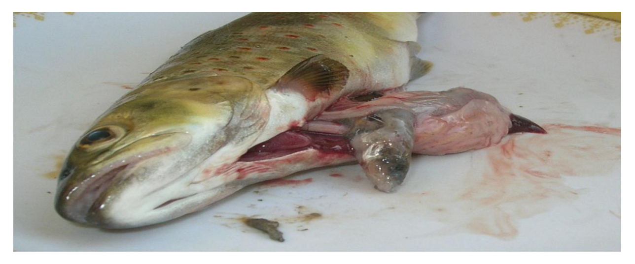
Fig. 5 Feeding preference of brown trout. Photograph showing fish fingerling in stomach of brown trout. Photograph number DSCN3615 taken during the study.

sometimes seems to be one of the main reasons for establishment and spread of brown trout in the region. Besides this habit, reduced water level in specific pockets of rivers (in the area of hydroelectric power projects), seems to be favoring