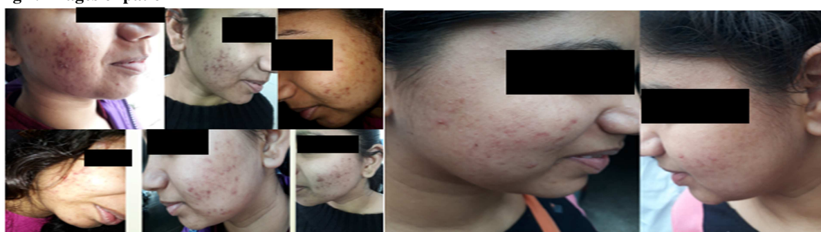
Fig 1. Images of patient