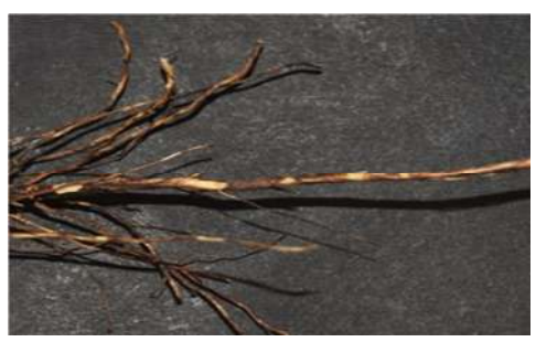
Figure 1: Pratylenchus thornei , a root lesion nematode of chickpea. Figure 2: Symptoms due to Pratylenchus thornei , a root lesion nematode on chickpea roots as lesions.